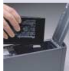
Hot-swappable batteries make it easy for users to replace batteries. (available on most APC UPSs)