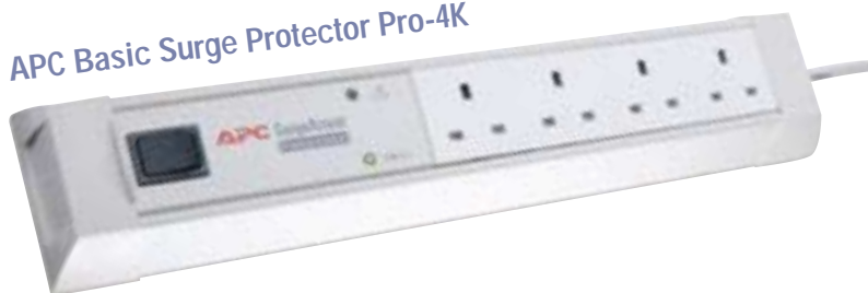
APC Basic Surge Protector Pro-4K

In order to provide that clean, safe power, your surge suppressor must be able to reduce harmful excess voltage, filter electrical noise, and, in the event of a catastrophic surge event, "give its life" to stop future spikes and surges.