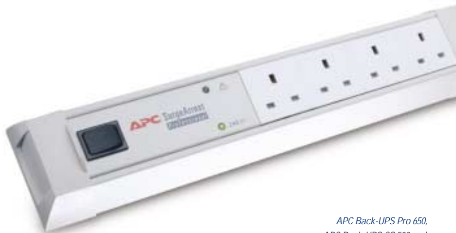
APC Back-UPS Pro 650, APC Back-UPS CS 500 and APC SurgeArrest

APC was chosen by PC Magazine as one of the "Top 100 Technology Companies That Are Changing The World" (10/99).