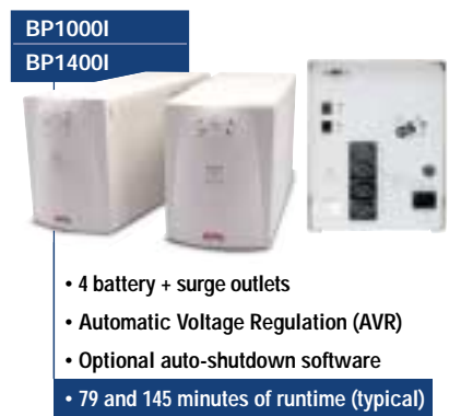
The Back-UPS Pro 1000 and 1400 have enough power to keep a couple desktop computers running through a power outage.